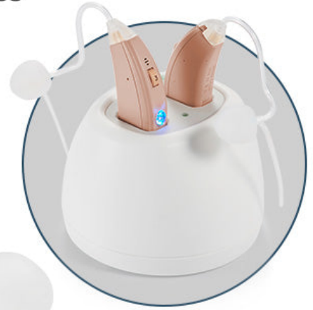
Can be Installed in Reverse