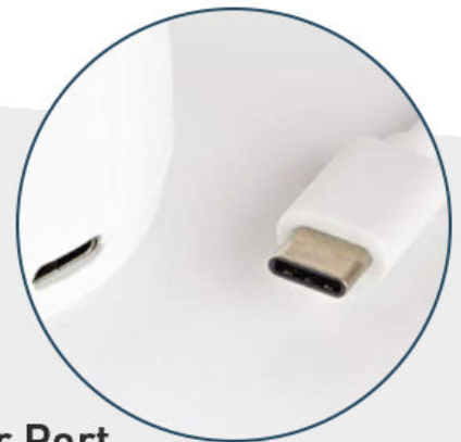
USB-C Power Port

4 Hours Fast Charge Can be Plugged in Reversely