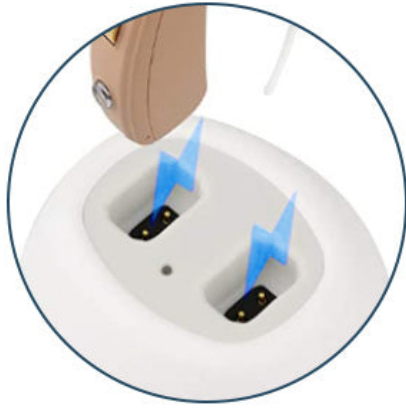
Magnetic Charging Dock